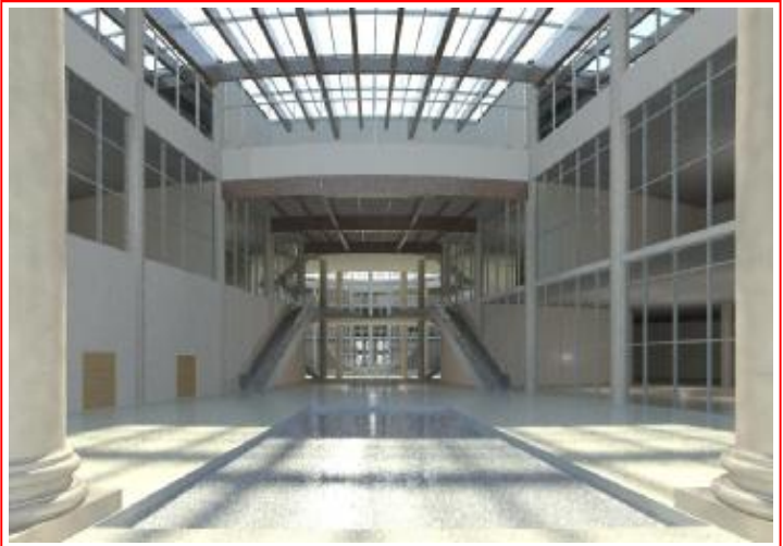
A computer generated image of the interior of the main Atrium at World Prayer Centre

We continue on our "Isaac" journey to see a World Centre for prayer established in the heart of the nation. Although at times we get frustrated with the pace of developments, there are developments. In a few weeks time we shall be approaching the City authorities to begin a planning dialogue. Some surveys have been completed, a comprehensive statement of need has been written, detailed drawings are being finalised and we await the appointed moment (Isaac came at the appointed moment, humanly the most impossible moment) when the finance will be released.